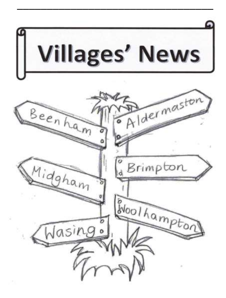
Please recycle me