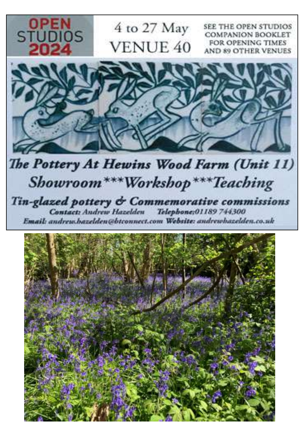
Bluebells on a recent BFWI walk.