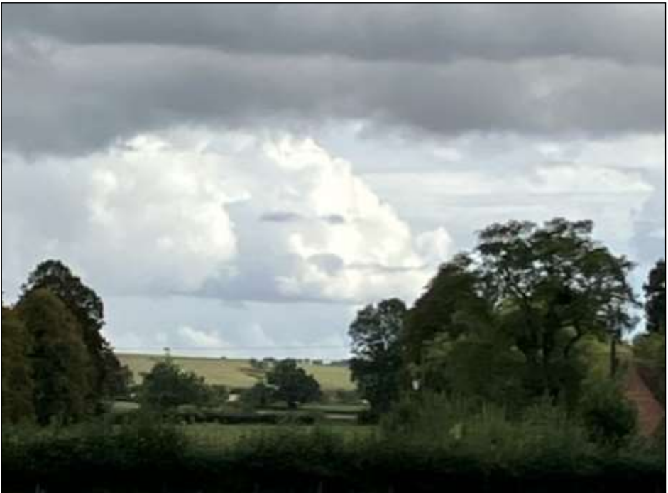
A cloud, seen over Hanbury Hall, Worcestershire, trying to blow the rain clouds away. It did not succeed.

By the time you read this winter, according to the clocks at any rate, will have arrived and the nights will be drawing in and we will be thinking of Christmas fare rather than harvest fare. Or planning somewhere in the sun in 2025?